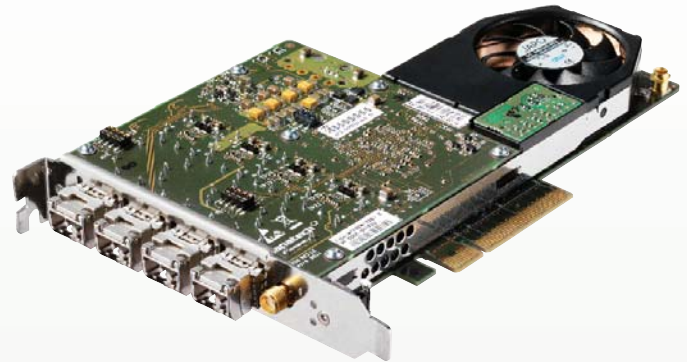
NT40E2-4: 4 x 10 Gbps PCIe Gen2

Intelligent features for flow identification, filtering and distribution to up to 32 CPU cores accelerate application performance while consuming less than 1% of CPU resources.