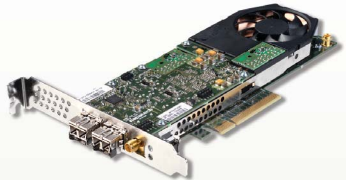
NT20E2: 2 x 10 Gbps PCIe Gen2

The NT20E2 In-line Adapter provides full line-rate processing, analysis and retransmission of 10 Gbps data with zero packet loss, no matter the packet size. Advanced features, such as layer 2 to 4 traffic analysis, filtering, OS bypass and balanced multi-CPU traffic processing ensure that all relevant traffic is quickly transferred to the appropriate application without impacting CPU performance. The NT20E2 In-line Adapter is thus ideal for 10 Gbps applications that require hardware acceleration with maximum throughput and minimal CPU load. A comprehensive software suite is provided to allow quick and easy integration of the NT20E2 In-line Adapter supporting Linux, FreeBSD or Windows operating systems.