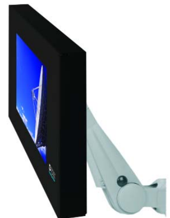
Stand-Alone (VESA Swing Arm opt.)